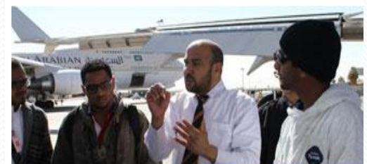
College of Engineering